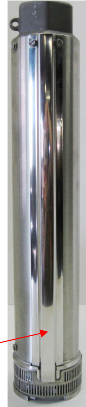
STAINLESS STEEL CASING AND CABLE GUARD