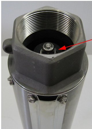
STAINLESS STEEL DISCHARGE HEAD TAPPED 2" NPT